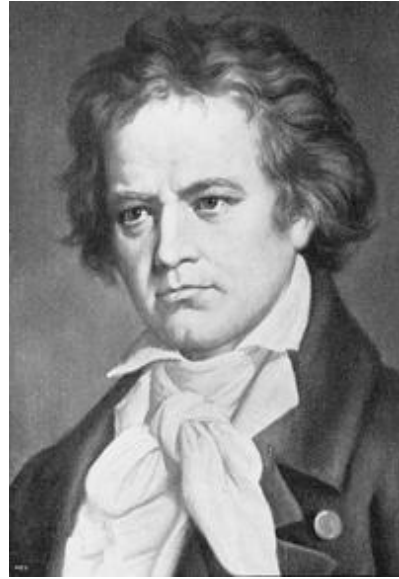
Ludwig van Beethoven